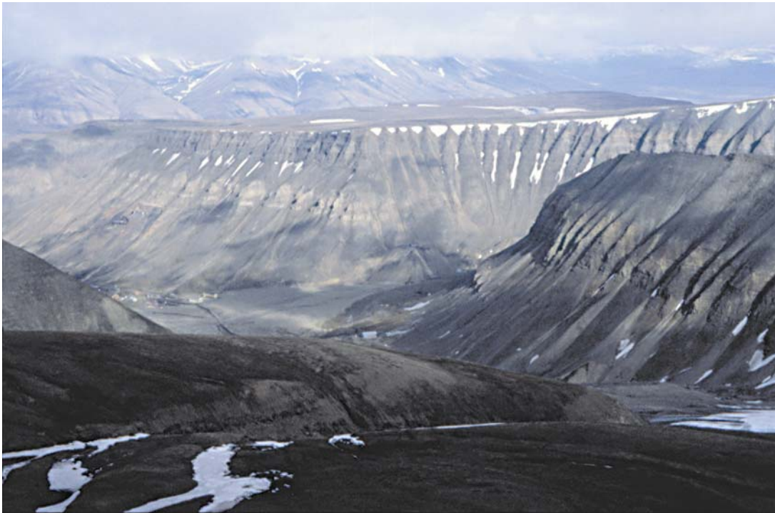
Figure 1 Gruvefjellet on the eastern side of Longyeardalen. The light coloured beds in the middle part of the mountain side are sandstones of the Firkanten Formation (note the mine entrance), followed by the shales of the Basilika Formation. Sandstones of the Grumanybyen Formation crops out in the steep cliffs at the top of the mountain

The Cretaceous Carolinefjellet Formation was deposited in prodelta to distal marine shelf conditions succeeding the fluvial and delta progradation of the underlying Helvetiafjellet Formation. Along the road from the airport to Longyearbyen shales and sandstones of the Langstakken Member of the Carolinefjellet Formation crops out. The member consists of alternating shales, siltstones and flaggy, thin-bedded grey sandstones deposited in inner shelf conditions.